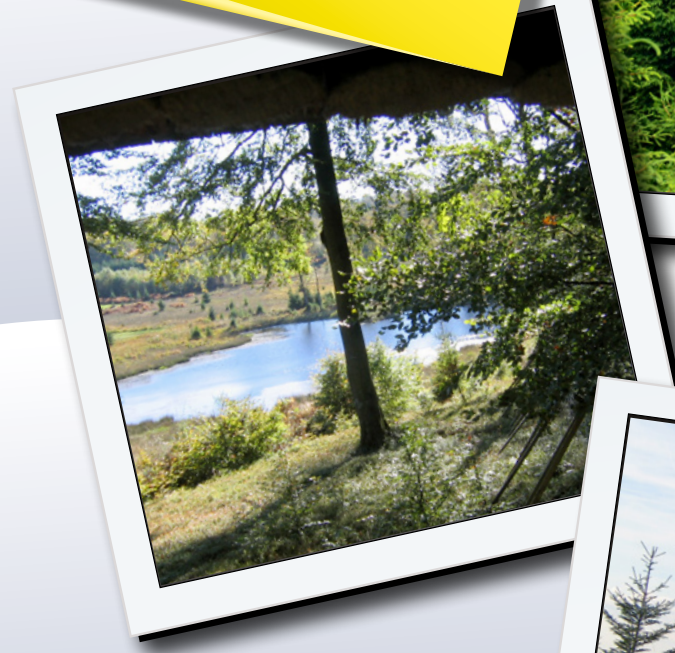
Bilaude observation platform