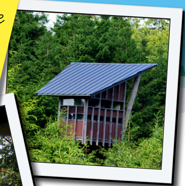
Priese observation tower