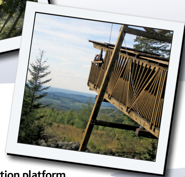
The Huttes observation platform